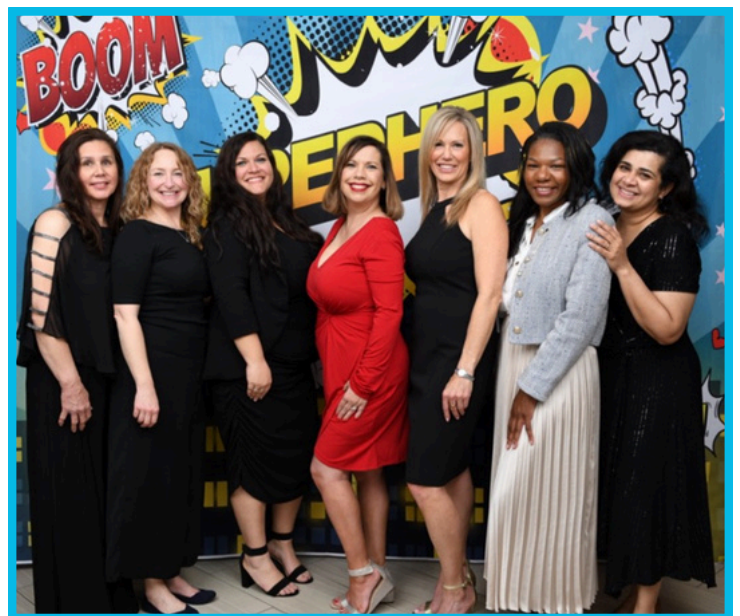
Early Smiles Sacramento Staff

The trainings aimed at achieving consistency and adherence to best practices in the Early Smiles Sacramento screening processes.